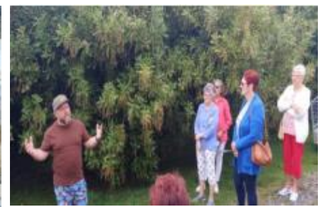
learning about macadamia nuts.