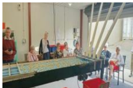
the processing plant,