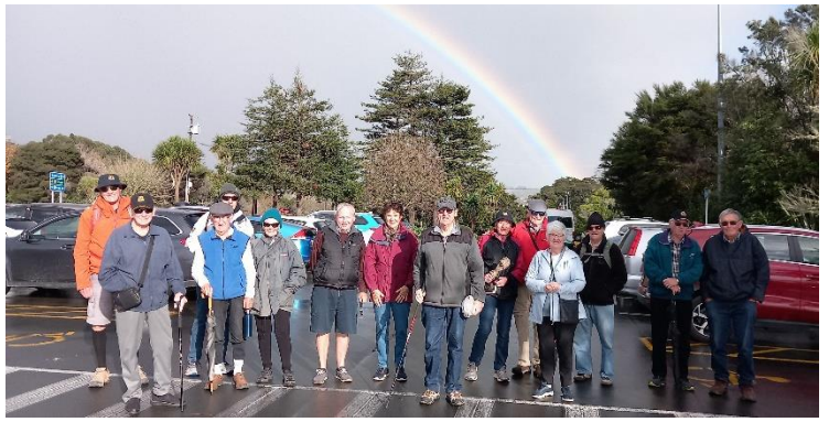
and 27 th May, Albany. Who found the pot of gold?