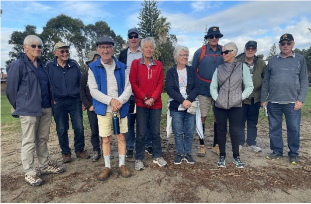
The Ramblers, 6 th May, Orewa Beach,