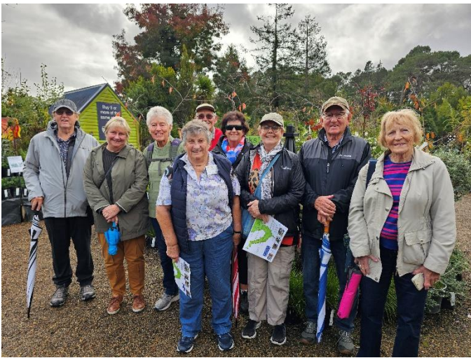
Happy members visited Kaipara Sculpture Gardens.