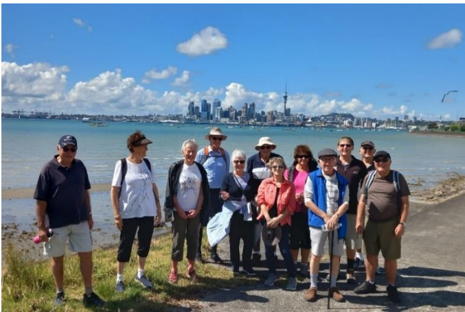
The Ramblers enjoying their Monday exercise at Northcote Point, 6 th November.