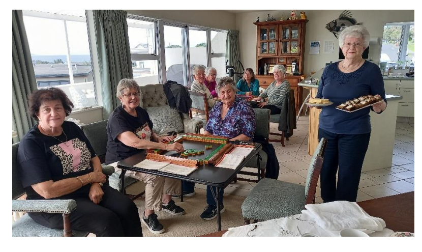
and 28th October, Gulf Harbour Ramble.

The Mah Jong Group continues to meet every Wednesday – afternoon tea included, as well as exercise for our brains!