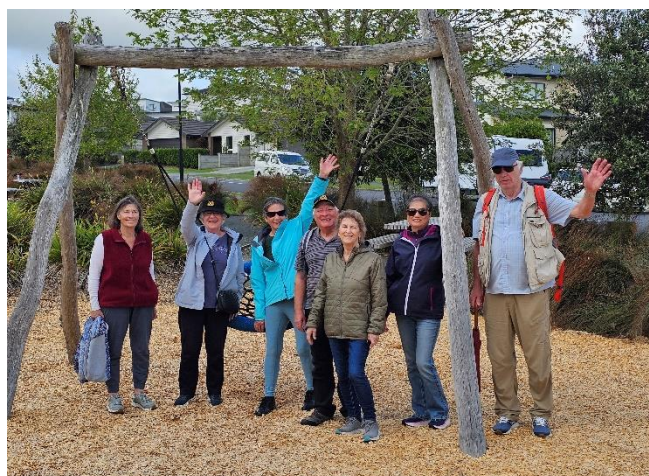
and 23 rd September at Millwater.