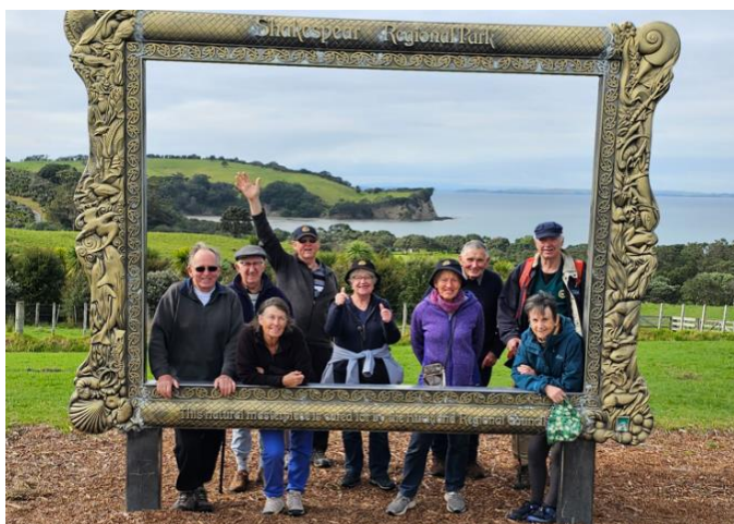
The Ramblers , 16th September, at Shakespear Park,