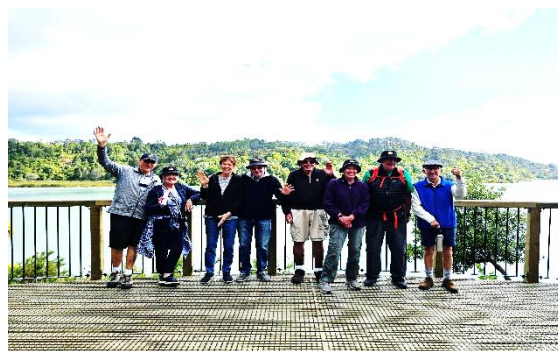
and 4 th November, Shepherds Park Ramble.