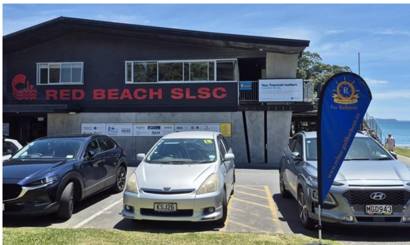
Our Flag marked the venue.