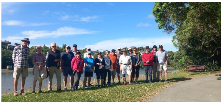
The Ramblers , 25 th November, Orewa Estuary,