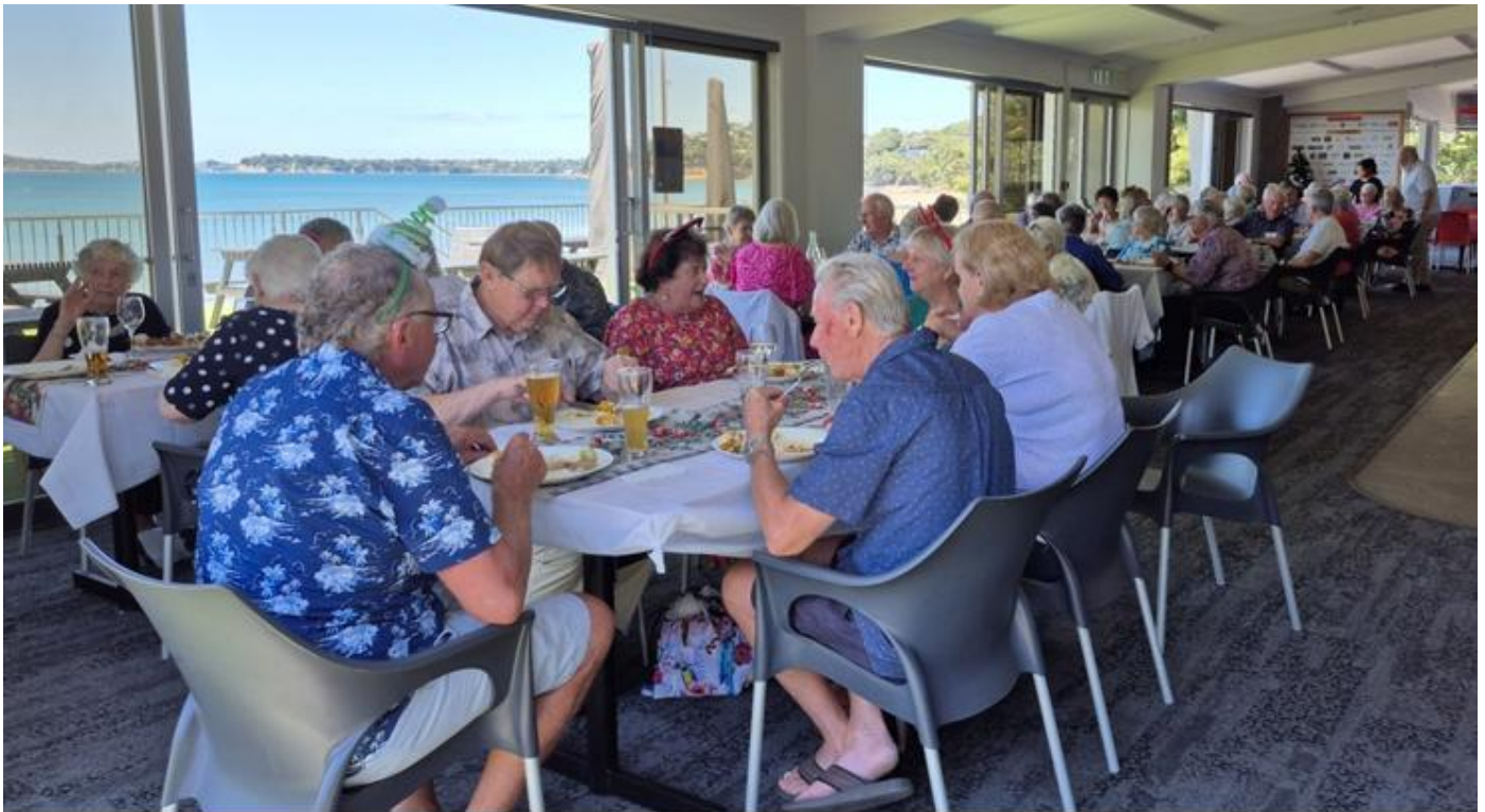
Members tucking in to Christmas lunch function at Red Beach Surf Lifesaving Club