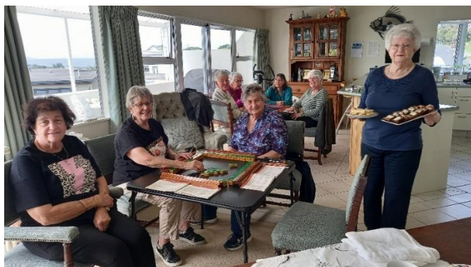
The Mah Jong Group continues to meet every Wednesday – afternoon tea included, as well as exercise for our brains!