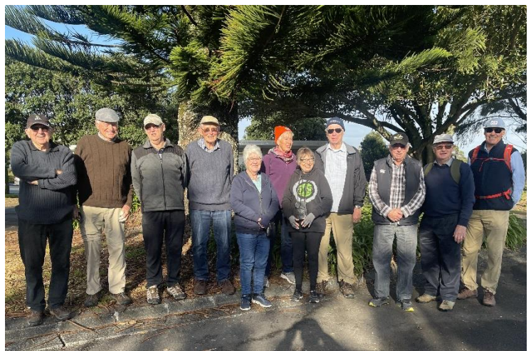
The Ramblers , left, under Grafton Bridge, 7 th August, and right, at Orewa, 14 th August.